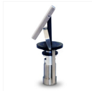
Ultra Tech T-Mac System