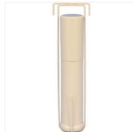
CAP-MAC-S Moly Assay Canister For Syringes