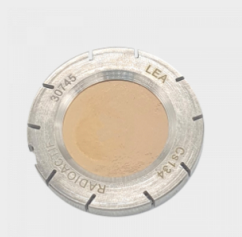
Beta Calibration Point Sources