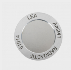
Alpha Calibration Point Sources