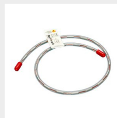
Cobalt 57 Line Sources