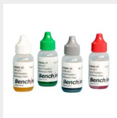
Dose Calibrator Sources "E" vial Products