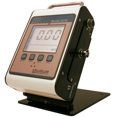
Model 3276 with desktop stand option